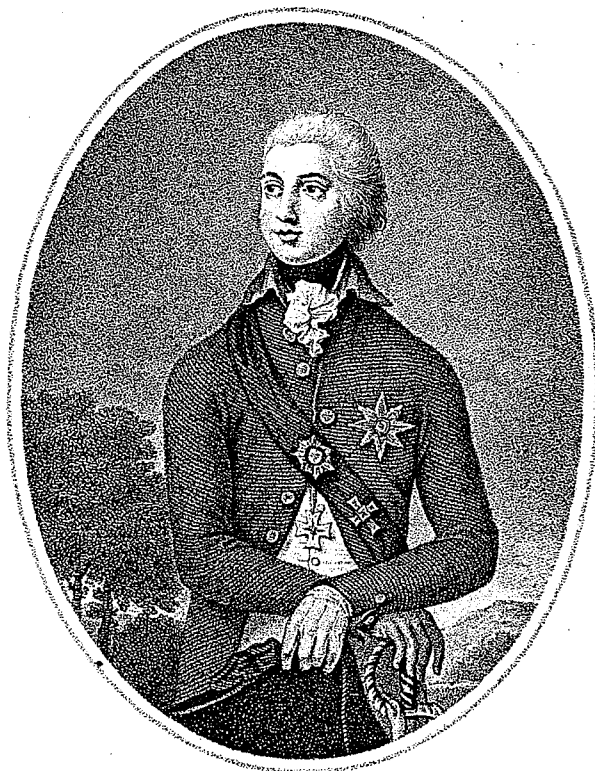
His Royal Highness Prince William Frederick of Gloucester.